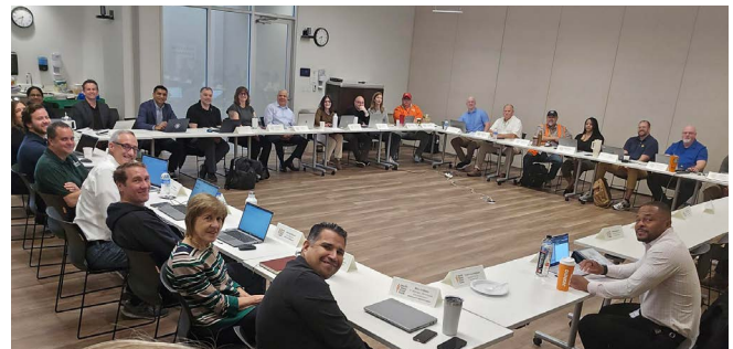
A kickoff event was held at North Texas Food Bank, one of the food bank pilot locations for the Microsoft Dynamics 365 (D365) ERP solution.

Enterprise Resource Planning (ERP) Modernization is a critical initiative for the network, rooted in learnings from neighbors facing hunger and the network. This effort aims to strengthen our capacity to serve neighbors with the right food at the right place at the right time and to do so by unlocking new capacity, innovation and digital fairness across the network. In April 2026, we kicked off five food bank pilots of the Microsoft Dynamics 365 (D365) ERP solution. Learnings from these pilots will help inform a potential networkwide rollout of the platform and shared data and process standards.