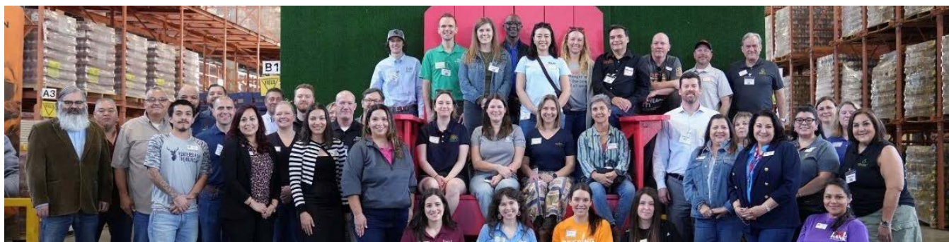
The Feeding America network is strengthened by regional cooperatives (also called regional co-ops) which are shared food hubs operated by network members to increase purchasing power, reduce costs and improve supply chain efficiency.

>34k Digital Actions Taken to support our fly-in efforts, including letters to Congress and petition signatures